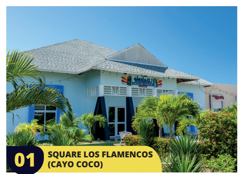
01 SQUARE LOS FLAMENCOS (CAYO COCO)

Ideal for those looking for recreational offers. There are shops, a Japanese restaurant, SPA and a Habano House with its Cigar Bar.