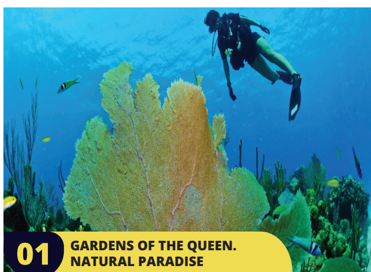
01 GARDENS OF THE QUEEN. NATURAL PARADISE

Gardens is made up of some 600 keys and small islands. It is one of the last major intact marine protected areas (MPAs) in the Caribbean. Ideal for contemplative diving and fishing sports. One of its great attractions is swimming with sharks and crocodiles.