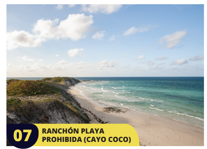
07 RANCHÓN PLAYA PROHIBIDA (CAYO COCO)

Located on the seashore, it is a place with excellent comfort to have a cold drink, a snack or a meal after a long walk on the beach.