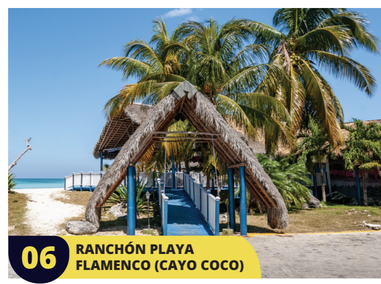
06 RANCHÓN PLAYA FLAMENCO (CAYO COCO)

It consists of a viewpoint located on Playa Pilar, one of the best beaches in the Caribbean. There you can enjoy various gastronomic options, as well as refreshing drinks and cocktails.