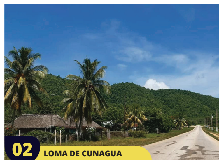
02 LOMA DE CUNAGUA

Gardens is made up of some 600 keys and small islands. It is one of the last major intact marine protected areas (MPAs) in the Caribbean. Ideal for contemplative diving and fishing sports. One of its great attractions is swimming with sharks and crocodiles.