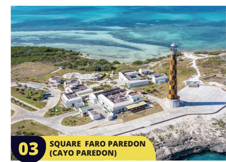
03 SQUARE FARO PAREDON (CAYO PAREDON)

You can enjoy various recreation and leisure facilities, such as bowling, nightclub, SPA and souvenir shops.