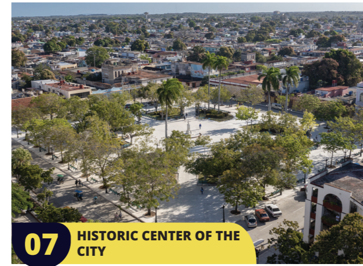
07 HISTORIC CENTER OF THE CITY

Ideal place to enjoy nature tourism in a sustainable way. This is a natural reservoir with an area of about 5 sq. km, surrounded by unusually beautiful mangrove forests and an extensive network of natural canals feeding the lagoon. The lagoon has the largest concentration of perch and trout on the entire island.