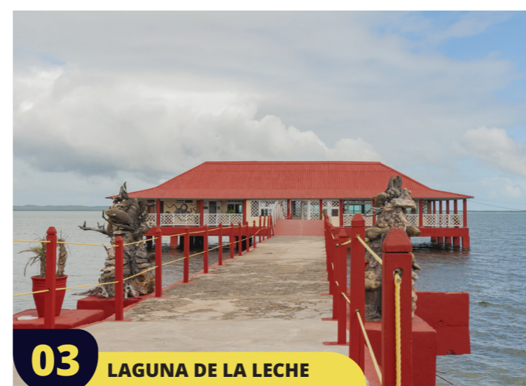
03 LAGUNA DE LA LECHE

It is the main elevation of the province of Ciego de Avila. A site of important archaeological discoveries and turned into an ecological reserve since 1985, with an area of 2,742 hectares. It has a fauna with a high endemism.