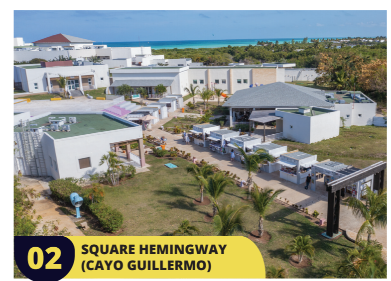
02 SQUARE HEMINGWAY (CAYO GUILLERMO)

Ideal for those looking for recreational offers. There are shops, a Japanese restaurant, SPA and a Habano House with its Cigar Bar.