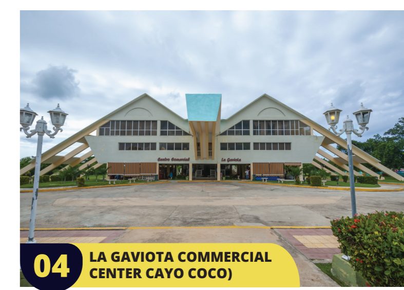
04 LA GAVIOTA COMMERCIAL CENTER CAYO COCO

Attractive proposal facing the sea, with varied offers such as "Adam and Eve" Spa and Wellness Center that provides multiple services. Gastronomic offers such as Ice Cream Parlor, "Rocas del Mar" Snack and a Habano House.