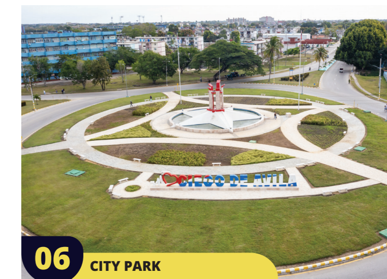
06 CITY PARK

It is located in the city of Moron, and founded in 1930. You can see agricultural implements dating from this date. The farm has become a reference in terms of the use of agro-ecological practices, ensuring healthier productions and environmental protection.