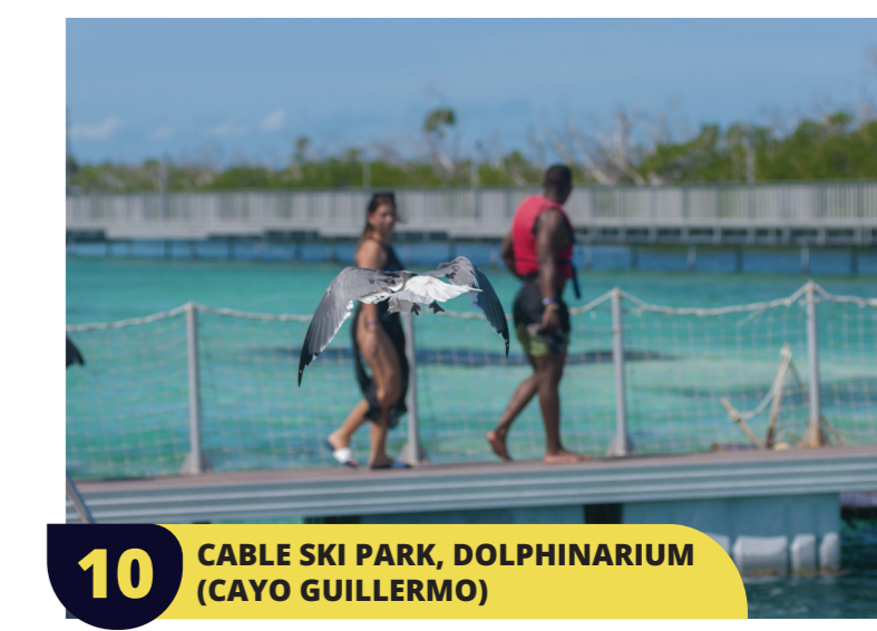
10 CABLE SKI PARK, DOLPHINARIUM (CAYO GUILLERMO)

It is considered the largest and most functional on the Island. It has enough space for dolphin show, and you also have the possibility of taking photos and interacting with the dolphins.