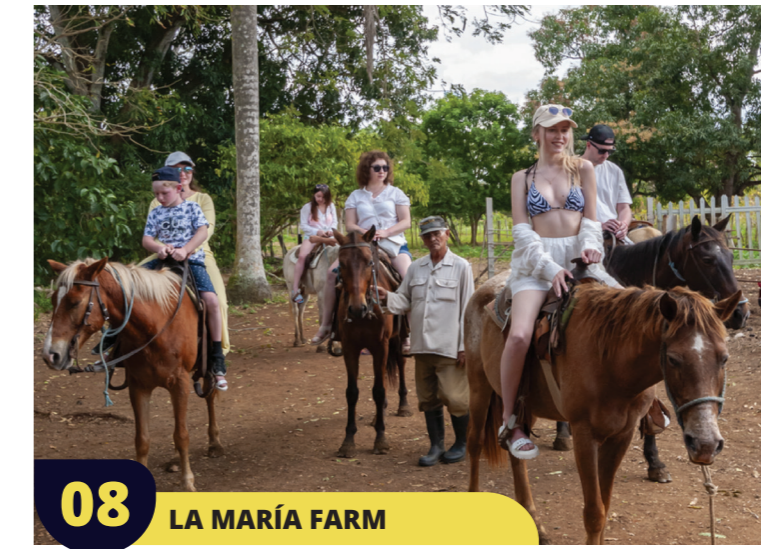
08 LA MARÍA FARM

Ideal to learn about the evolution and development of the Cuban sugar industry. Museum invites you to learn about the beginnings of the industry in the colonial period, agricultural mechanization and sugarcane varieties.