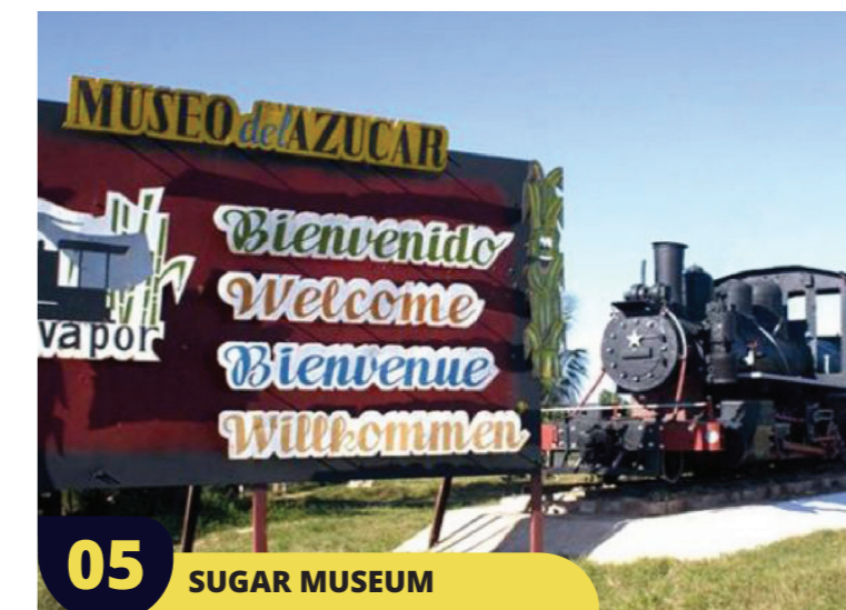
05 SUGAR MUSEUM

It currently occupies an area that covers a total of 57 blocks. In this area are the main buildings of heritage values of the city.