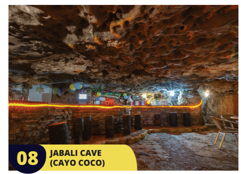
08 JABALI CAVE (CAYO COCO)

Restaurant overlooking the beach, famous for its Seafood Special (lobster, shrimp, fish, salad and rice).