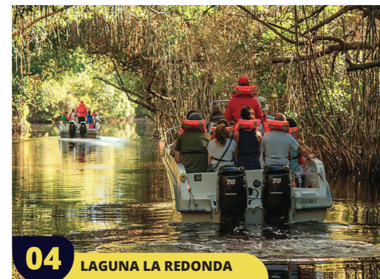
04 LAGUNA LA REDONDA

It is the largest freshwater reserve in Cuba, located north of the city of Morón, in the central province of Ciego de Avila. It owes its name to the size and whiteness of its waters.