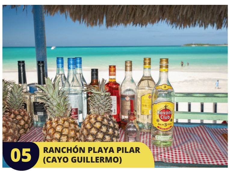
05 RANCHÓN PLAYA PILAR (CAYO GUILLERMO)

It is a great opportunity if you're looking for some Cuban souvenirs to bring back home. It offers commercial options in a varied network of specialized stores, including crafts and souvenirs.