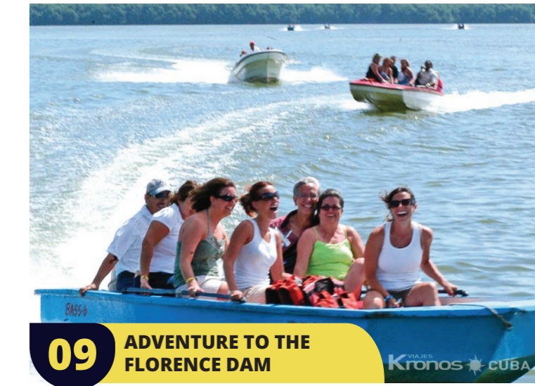
09 ADVENTURE TO THE FLORENCE DAM

You can find varied and interesting offers: restaurants and ranchones, nautical activities, points of sale, sports areas, fair areas, viewpoints and amusement parks.