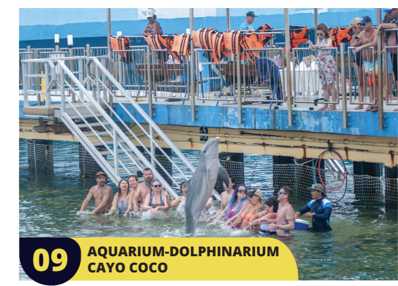
09 AQUARIUM-DOLPHINARIUM CAYO COCO

It offers a different experience, with nightly entertainment activities to enjoy the best of Cuban and international music.